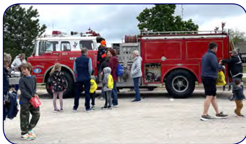
The NBHS Fire Truck on display at Safety Saturday