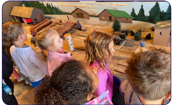
May 7th tour: Children enjoy watching the miniature logging camp in action