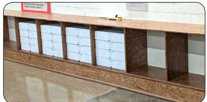
Citizen Bookcase along the west wall. A big THANK YOU to the New Berlin Junior Woman's Club for providing the funding.