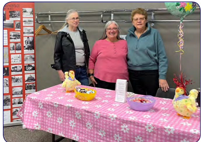
NBHS table at the Junior Woman's Club Easter Egg hunt