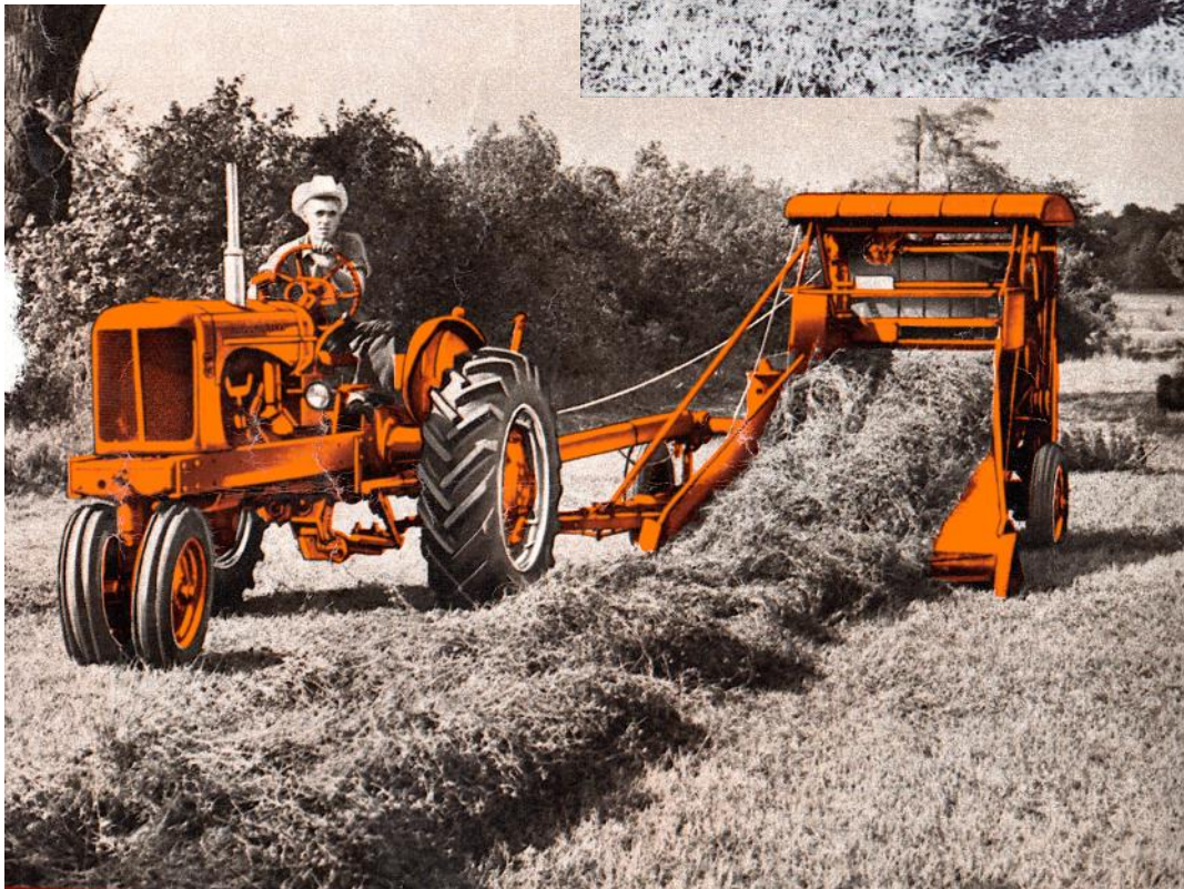
Figure 9. This 1954 proving grounds scene features Fritz driving the newly released WD 45 tractor.