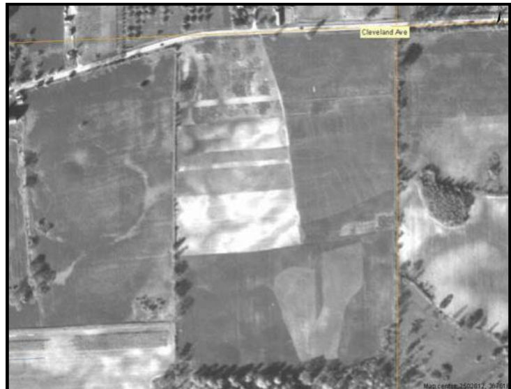
Figure 1. 1941 aerial view of future proving ground property (center) showing open farm fields.

Further research is needed to determine the timing more accurately, but one could speculate the AC proving ground in New Berlin was established after WWII, and operated until about 1960 when a new facility was constructed near Union Grove, WI.