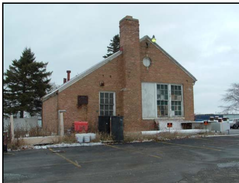
Figure 11. South side of service building 2009