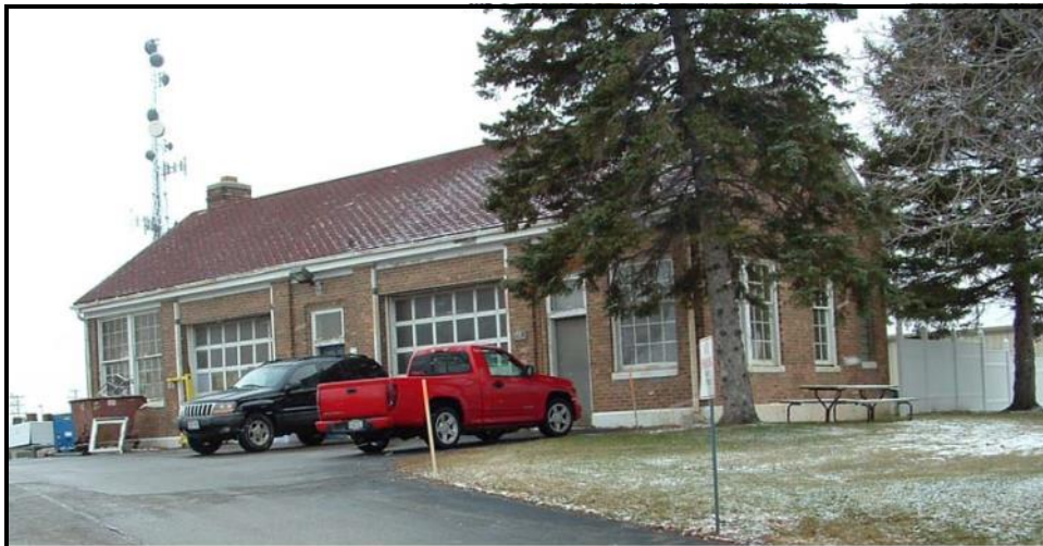
Figure 10. Former proving grounds service building as it appeared in late 2009