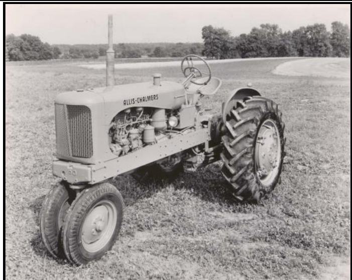
Figure 5. A preproduction WD with new diesel engine is shown in this 1953 photo taken at the New Berlin proving grounds.