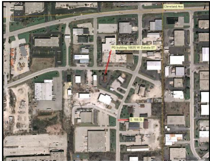
Figure 4. 2007 aerial view of property now part of the New Berlin industrial park. The service building remains intact.