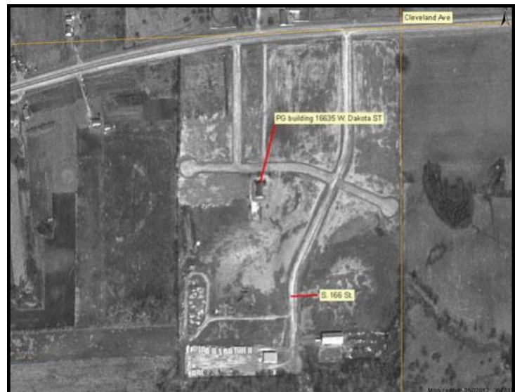
Figure 3. 1963 aerial view showing road development in progress for the coming industrial park.