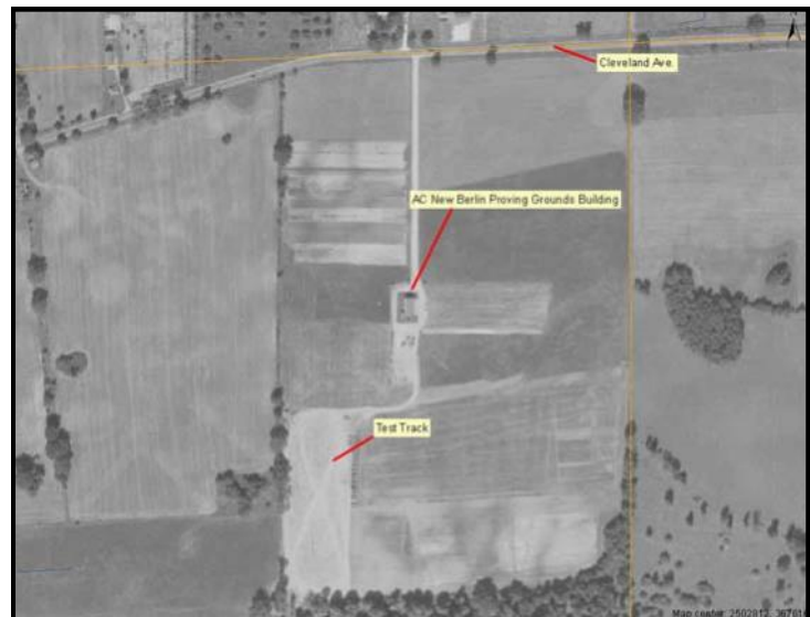
Figure 2. 1950 aerial view of proving grounds property. New service building and test track outline are visible.