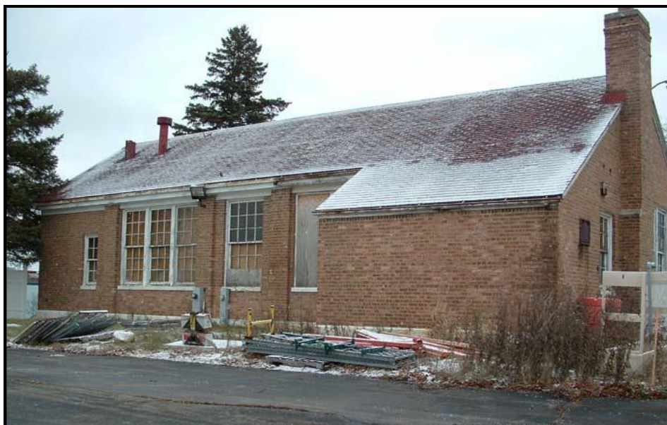
Figure 12. West side of service building as it appeared in late 2009