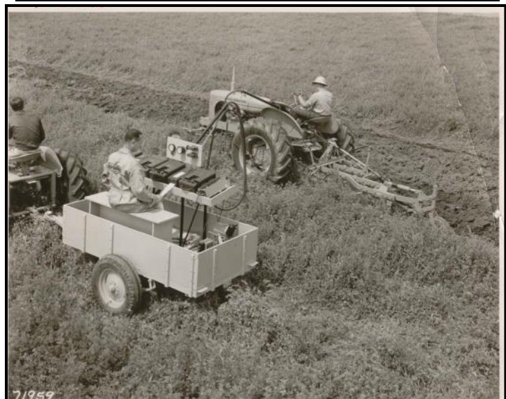
Figure 6. Field test of WD45 pulling 4 bottom plow c.1952