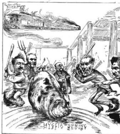
Waukesha Frightening Away the Chicago Hog. (Pitched by members of the Milwaukee Record.)