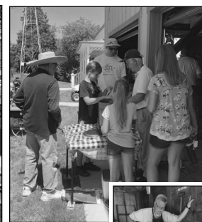
July 14th Open House & Ice Cream Social