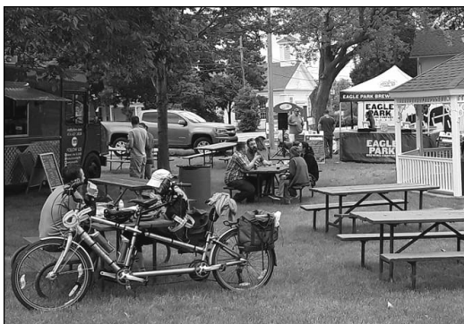
June 16th—Open House & Beer Garden