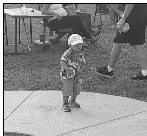
"Rockin' with the Band"

In August, we were excited to be able to offer a day when people could come to the Historic Park and enjoy a few hours with friends and family. We were blessed with great weather. There were lawn games and fun things for little kids. We also had a few of the buildings open to share with visitors. One little guy was enthralled by the band and joined right in. We had two special visitors, Little Ben and Tiny Tim, adorable miniature horses owned by one of our members. Be sure to watch for them at our Open Houses in 2021.