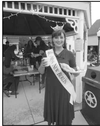
Miss New Berlin brightened all of our Open House events this year. Here she takes advantage of the good food at bargain prices from our food stand.