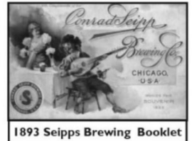
1893 Seipps Brewing Booklet